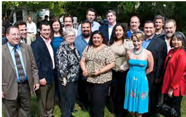
Elected officials attending the 2010 Smith-Weiss Environmental Champion Awards