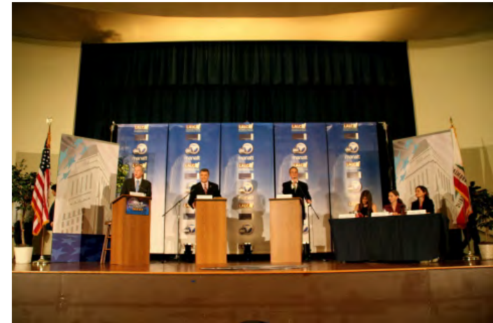
L.A. City Attorney Debate, April 22, 2009