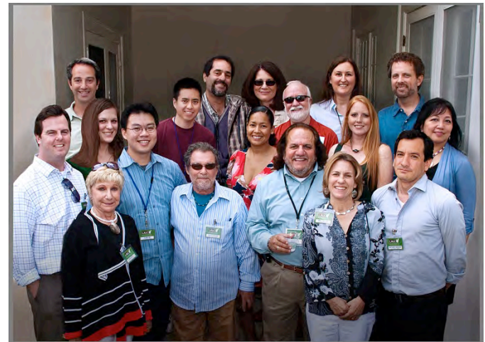
LALCV Board Members attending the 2010 Smith-Weiss Environmental Champion Awards