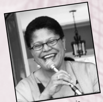
Karen Bass, California Assemblymember, Dist 47

The annual event raised $52,000. Proceeds included a silent auction of artwork, jewelry, Hollywood memorabilia, spa services, restaurant meals and a number of other items that drew a record number of bidders.